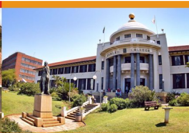
HOWARD COLLEGE CAMPUS